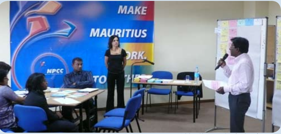
Workshop with representatives of employers / management

The findings from both workshops will form part of a report that will serve as a basis for further action with employees and management as well as the State.