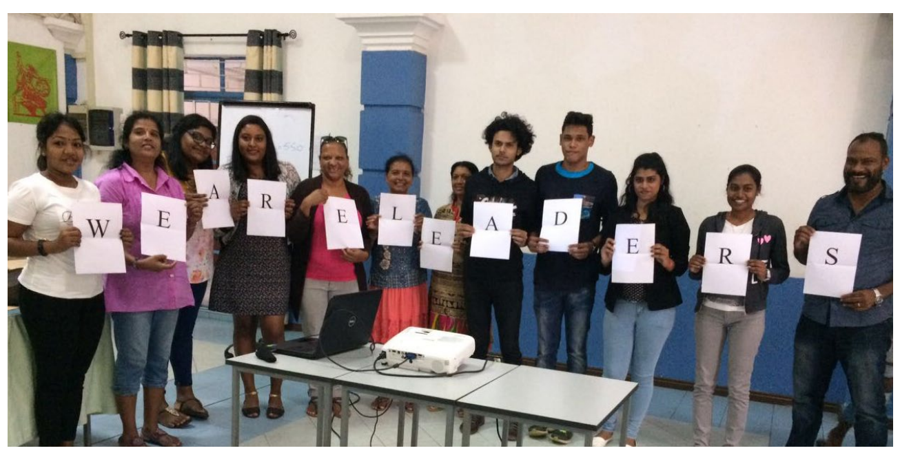
Young \ people from \ the \ Helve tia \ Youth \ Centre \ showed \ great \ enthus iasm \ in \ the \ sensitis ation \ session.

Young people between 14 and 35 years old have been sensitised on leadership during the months of August, September and October in the youth centres of the nine districts of the island.