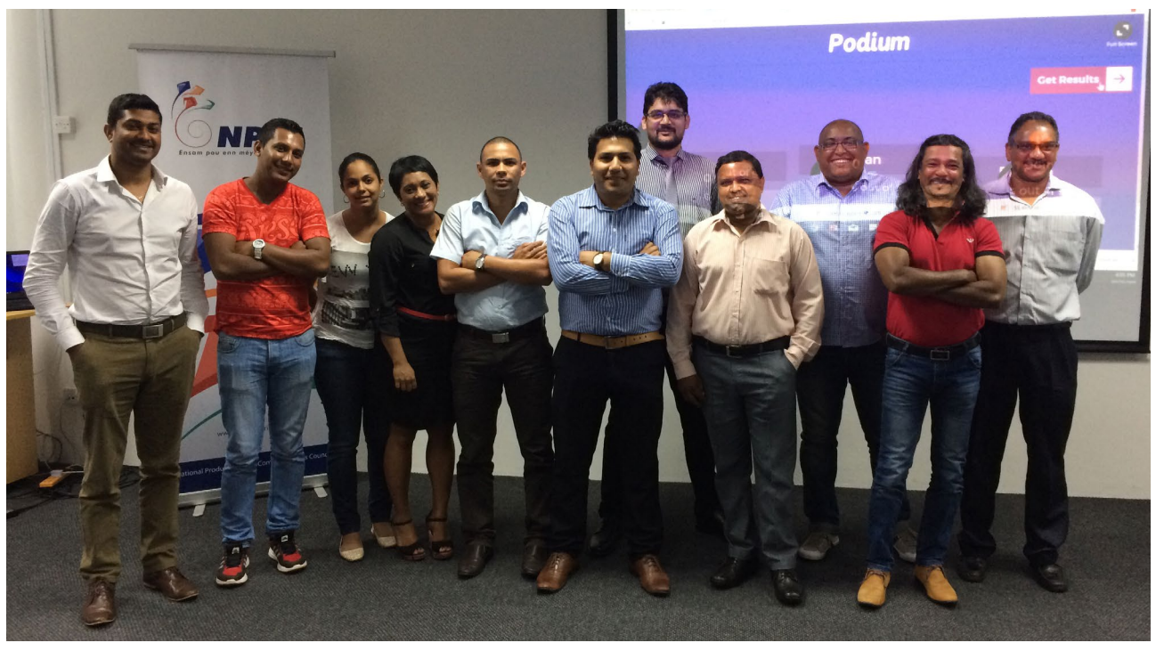
The participants learned how they can calculate risks and enhance their supply chain.

Heightening competition among companies to grab a larger part of their market share means that no one can afford to sit on their laurels no matter how successful their business is. Understanding what it takes to ensure a smooth production and considering every little risk affecting operations has become a critical must for everyone.