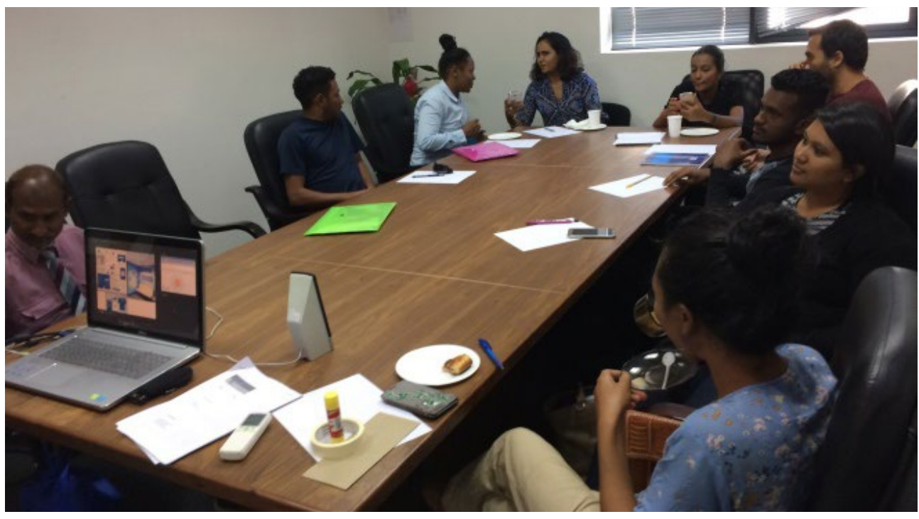
The course focused on business goals and business models, leadership and developing capabilities.

The NPCC partnered with the Jeune Chambre Internationale (JCI) to help young and aspiring entrepreneurs in applying methods and techniques that could give a boost to their businesses and increase their productivity through the Higher Productivity for Young Entrepreneurs course.