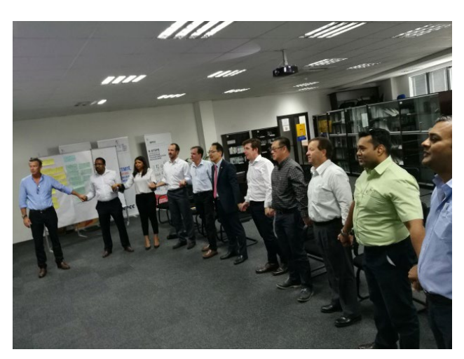
Members of top management of the model companies

Members of the top and middle management of the Model Companies, namely Axess, Scomat and Rey & Lenferna, had the opportunity to participate in training sessions led by the two Japanese experts.