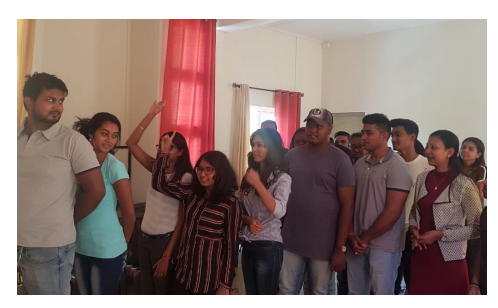
Pamplemousses Youth Centre