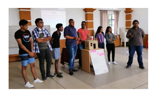
Montagne Blanche Youth Centre