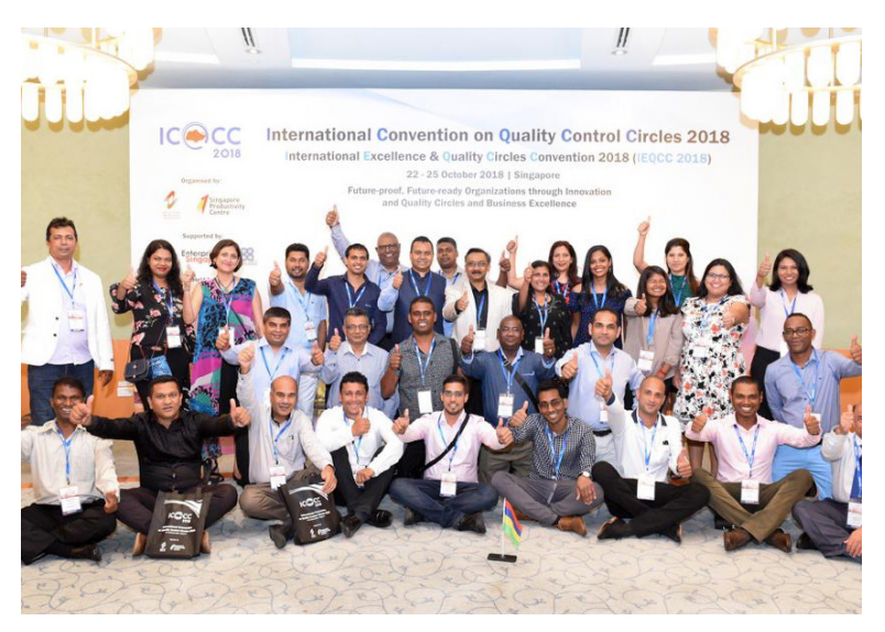
The Mauritian Team awarded for the ICQCC 2018 in Singapore