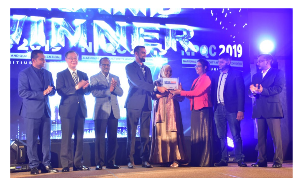
Neel Trading & Facilities Ltd

SMALL AND MEDIUM PRIVATE ENTERPRISES INCLUDING MICRO ENTERPRISES